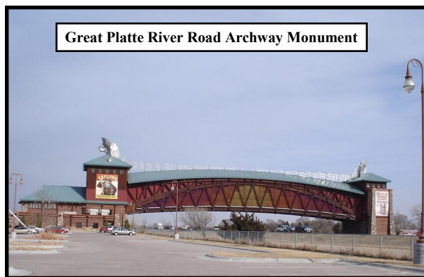
Great Platte River Road Archway Monument

After we have received their first deposit, ENF will send each person an insurance certificate for this policy. The policy also provides limited life and medical coverage for each person, along with certain other trip benefits.